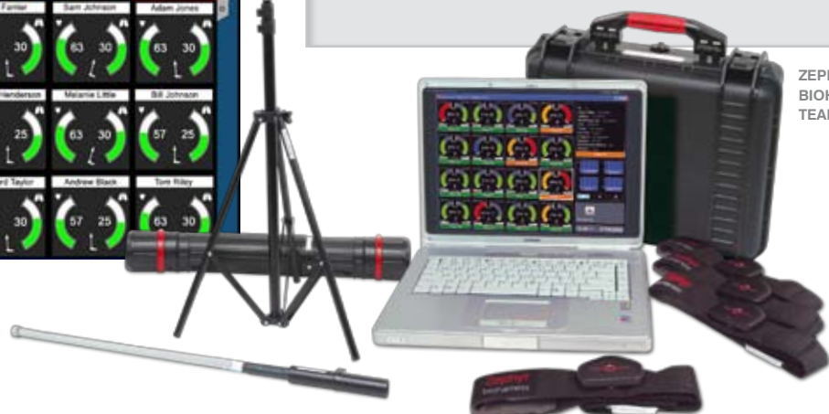
ZEPHYR BIOHARNESS™ TEAM SYSTEM