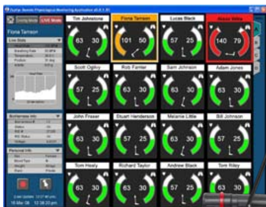
LIVE DISPLAY SHOWS ALL PLAYERS ON THE FIELD

The comprehensive data gathered combines physiological and motion-based parameters to give context to performance analysis. Zephyr's BioSense™ algorithms combine breathing rate, heart rate and activity monitoring to allow automatic detection of ventilatory threshold and heart rate recovery, while the visibility provided by the whole system also allows simple real-time interpretations for conditions such as dehydration, heat stroke risk, and fatigue.